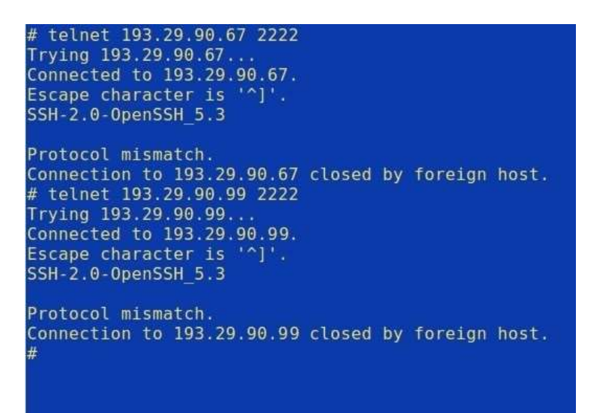
Fig. 9: Test of CRE using telnet