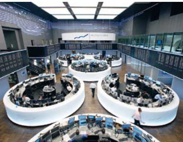
AN ALL-AROUND SUCCESS: THE FULLY RENOVATED TRADING HALL REOPENS IN 2007