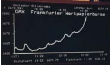
DAX: UNCHALLENGED FROM DAY ONE