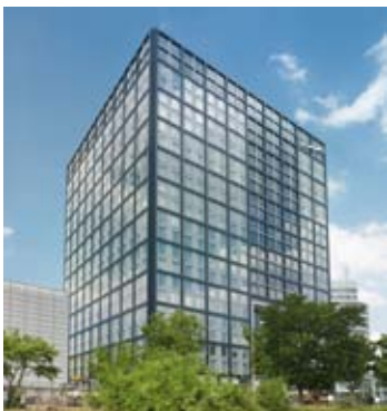
TRANSPARENT, EFFICIENT, ENVIRONMENTALLY-FRIENDLY: THE NEW EXCHANGE HEADQUARTERS.

2003 1 January: The new segmentation of the stock market comes into force at the Frankfurt Stock Exchange at the beginning of the year. At its heart are two new market segments, Prime Standard and General Standard. Prime Standard places high transparency requirements on issuers. In General Standard, the legal requirements continue to apply.