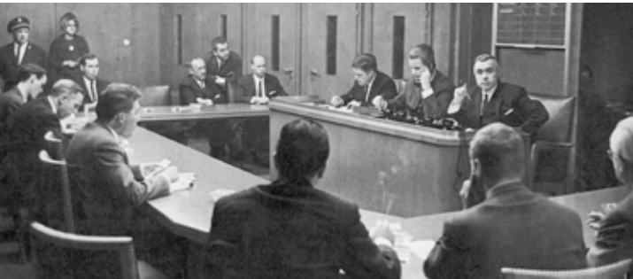
CURRENCY EXCHANGE MEETING, MID-1960S