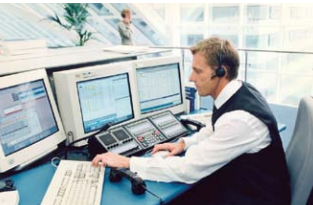
ADVENT OF THE FUTURE: XETRA, THE WORLD'S FIRST FULLY ELECTRONIC TRADING SYSTEM, REVOLUTIONIZES THE CASH MARKET.