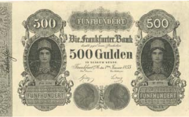
NOTE ISSUED BY "FRANKFURT BANK" (1855)