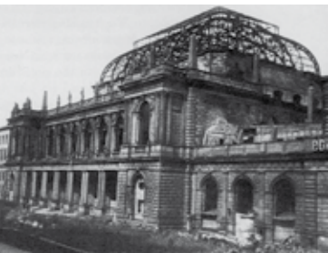
THE BOMBED-OUT EXCHANGE