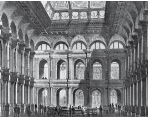
NEW LOCATION IN 1879, STILL ONE OF FRANKFURT'S MOST SIGNIFICANT BUILDINGS TODAY