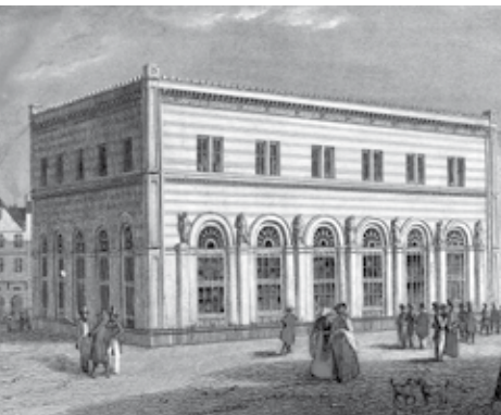
THE "HISTORIC EXCHANGE" AT PAULSPLATZ (1845)