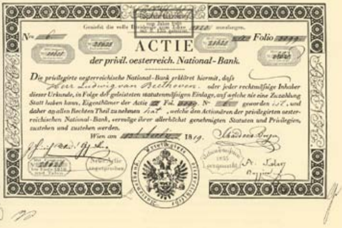
FIRST SHARES TRADED IN FRANKFURT