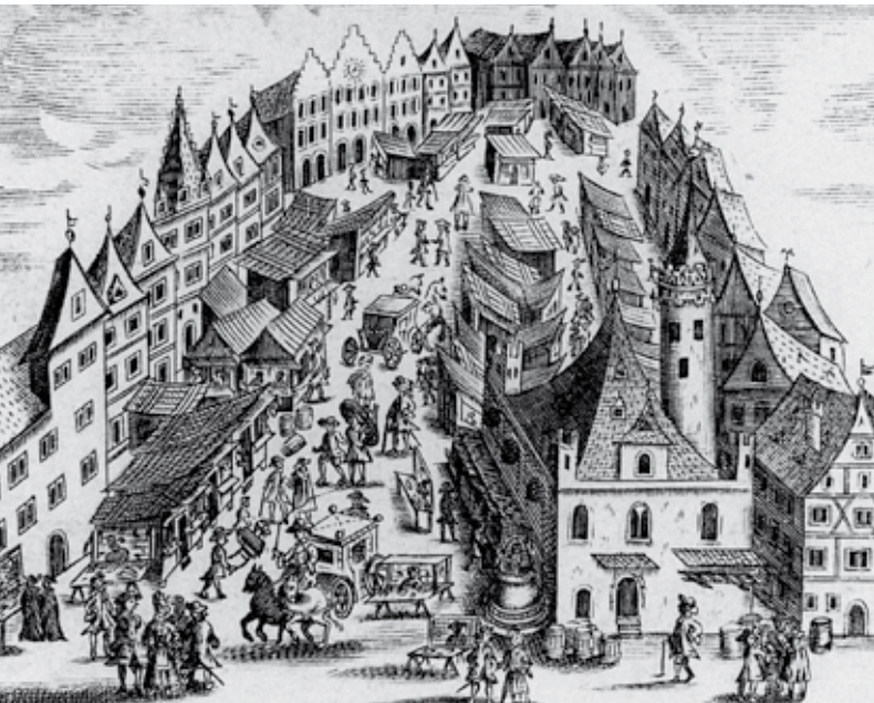
THE TRADE FAIR IN MEDIEVAL FRANKFURT