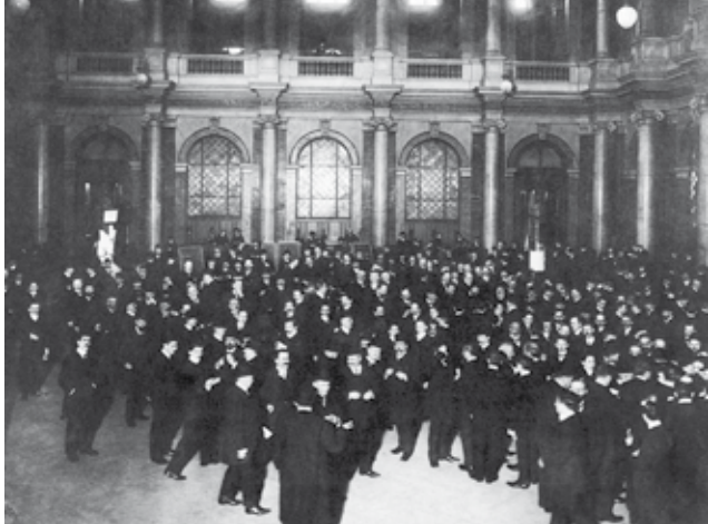
EXCHANGE MEMBERS MEETING AROUND 1914