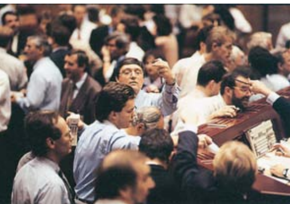
THE FUTURE IS NOW: DEUTSCHE TERMINBÖRSE COMMENCES FUTURES TRADING IN 1990.